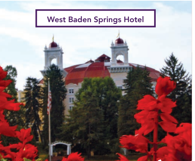
West Baden Springs Hotel