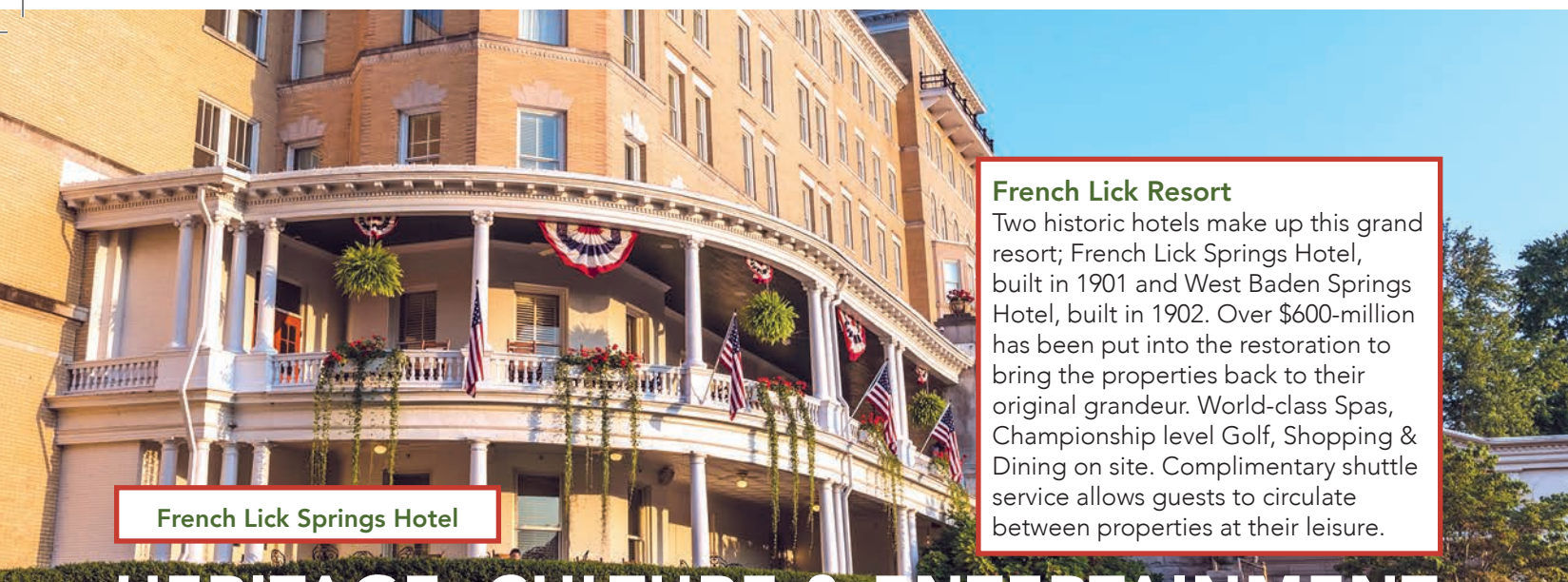
French Lick Springs Hotel

French Lick Resort Two historic hotels make up this grand resort; French Lick Springs Hotel, built in 1901 and West Baden Springs Hotel, built in 1902. Over $600-million has been put into the restoration to bring the properties back to their original grandeur. World-class Spas, Championship level Golf, Shopping & Dining on site. Complimentary shuttle service allows guests to circulate between properties at their leisure.